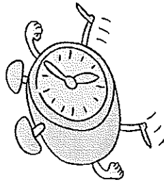
IT TAKES TIME!